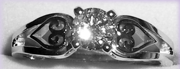
Completed custom engagement ring