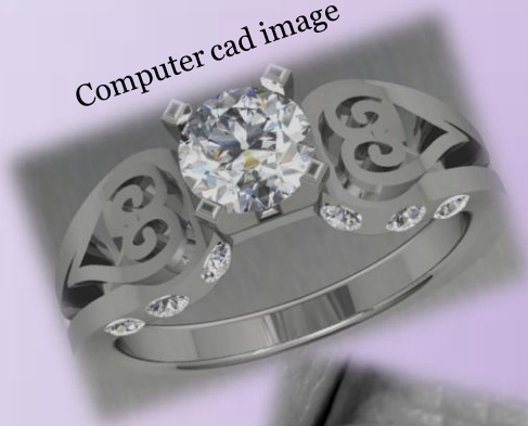
Computer cad image